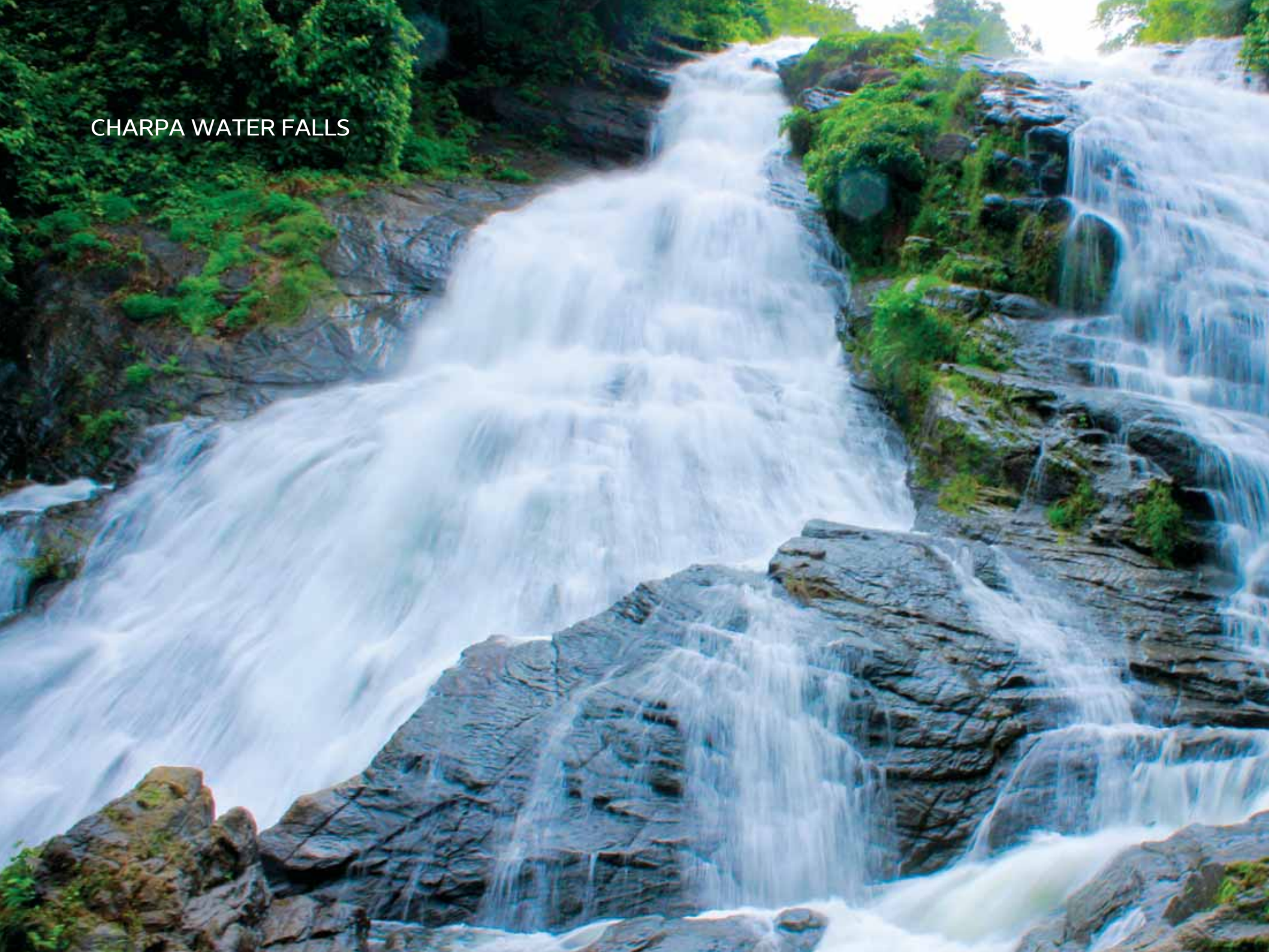
CHARPA WATER FALLS