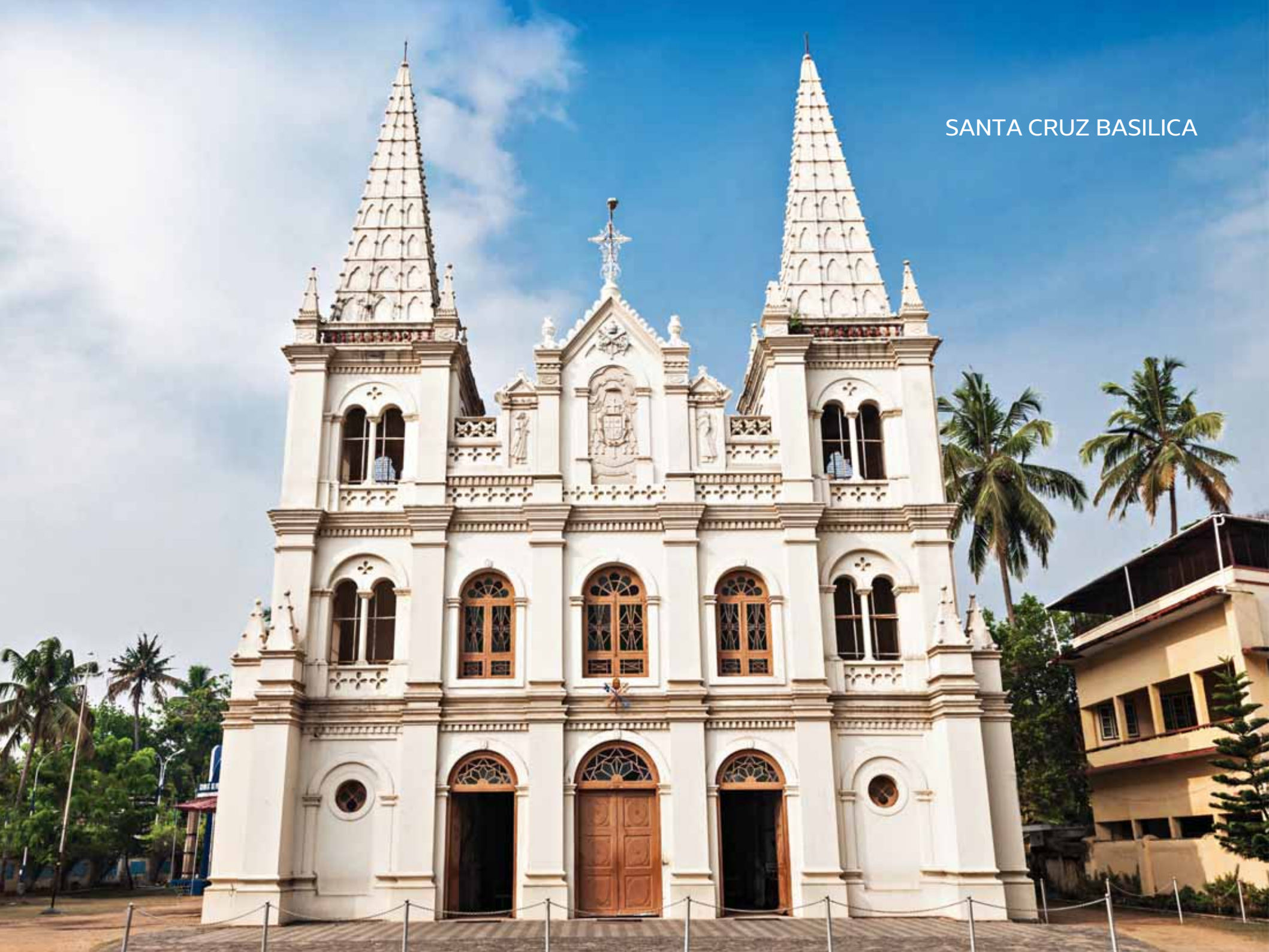
SANTA CRUZ BASILICA