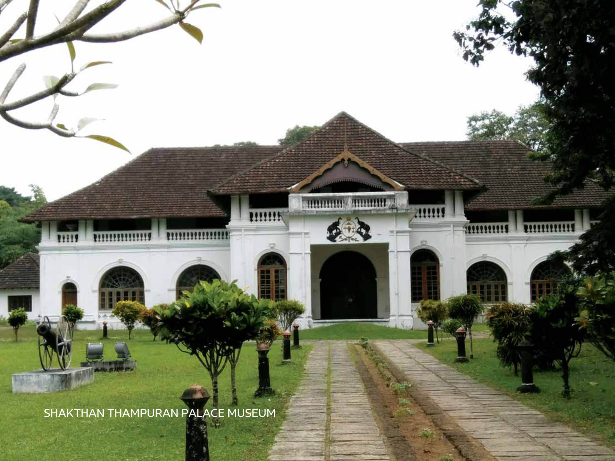
SHAKTHAN THAMPURAN PALACE MUSEUM