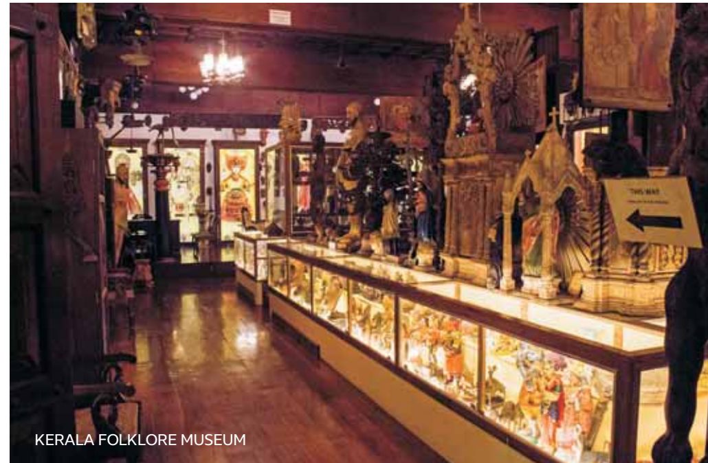
KERALA FOLKLORE MUSEUM

The "Cheenavala" as they are also called, are fixed land installations for fishing, also known as lift nets. It was commonly used in China and Indonesia over the past. In India, it is only seen in Cochin and surrounding coastal areas. The last years it became quite popular by foreign visitors, especially as a famous spot to watch the sunset. Nowadays, it seems like the trademark of tourism in Kochi!