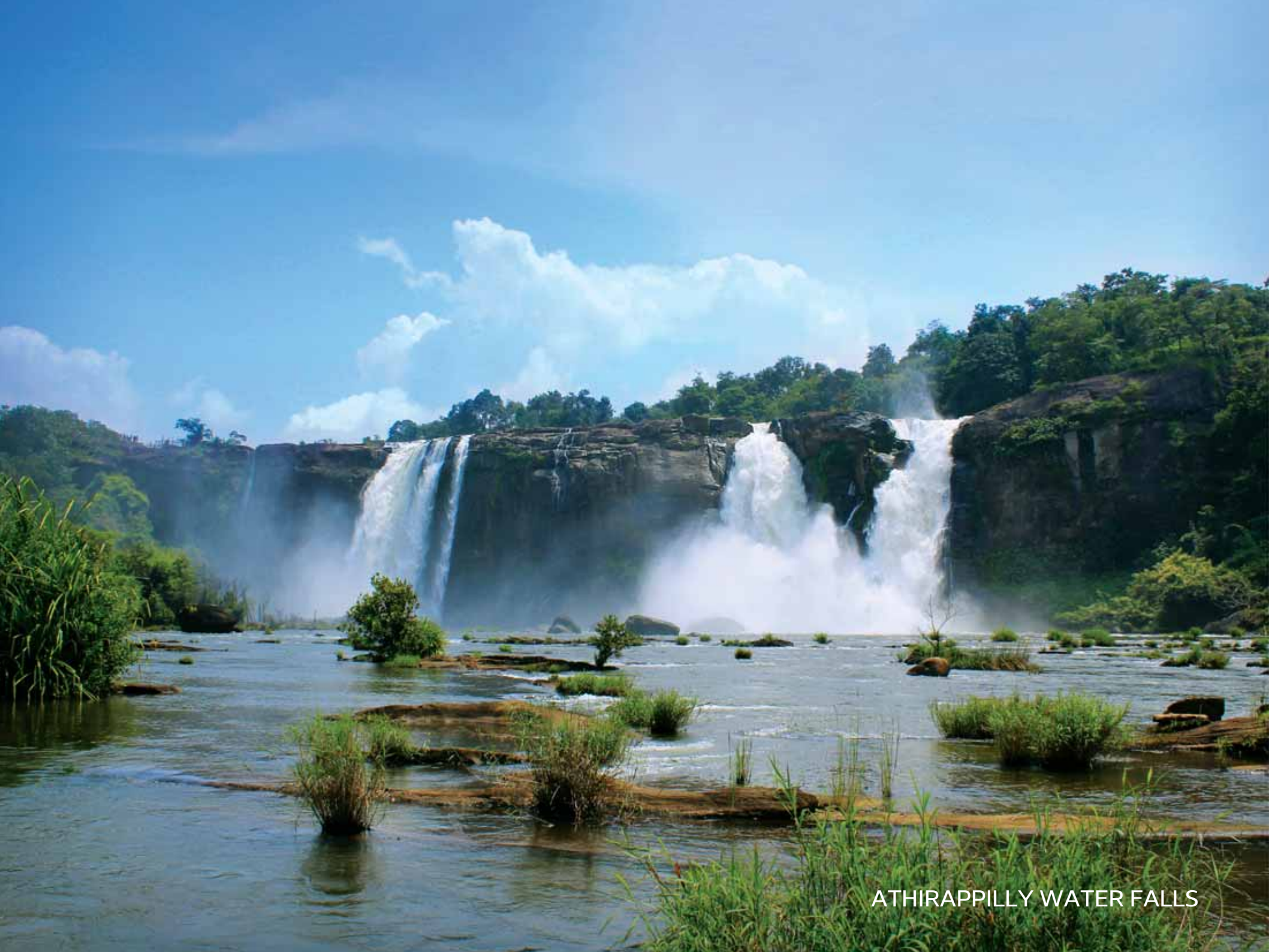
ATHIRAPPILLY WATER FALLS